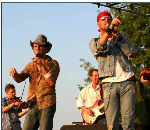
Locash Cowboys - SCG 2005