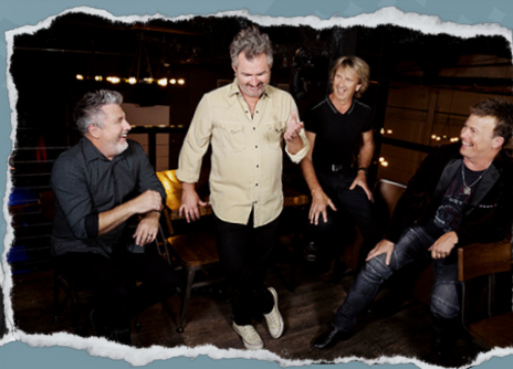
Lonestar Saturday, Sept. 3rd