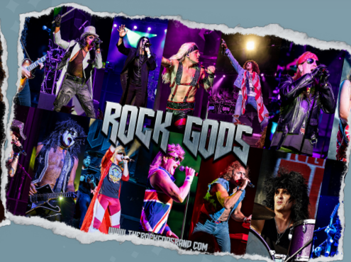
The Rock Gods Sunday, Sept. 4th

FOR MORE INFORMATION VISIT SANTACALIGON.COM