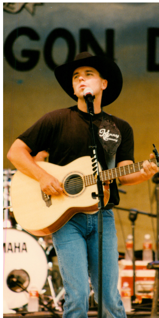
Kenny Chesney - SCG 1997

PLEASE NOTE: Event dates and details are subject to change without notice. Please check the Chamber calendar for the most current event details.