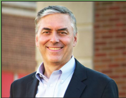
Mayor Rory Rowland City of Independence

Please register and plan to attend the July Membership Luncheon where Mayor Rory Rowland will be our guest speaker. Mayor Rowland will give an update on his first '100 Days' in office as mayor of the City of Independence.