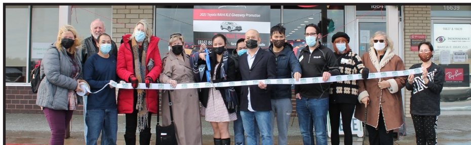
January 4, 2022 Belle Nail Studio 16641 East 23rd St. S. Independence , MO 64055