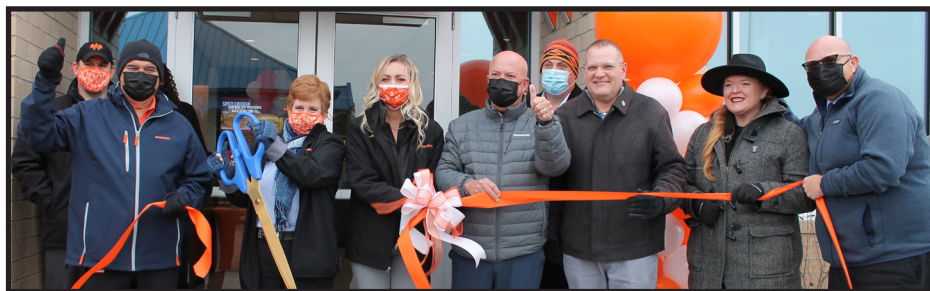
January 19, 2022 Whataburger 18811 E US 40 Hwy Independence MO 64055