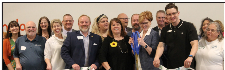
March 16, 2022 Animator Coworking Space 14300 E US Highway 40 Kansas City, MO 64136