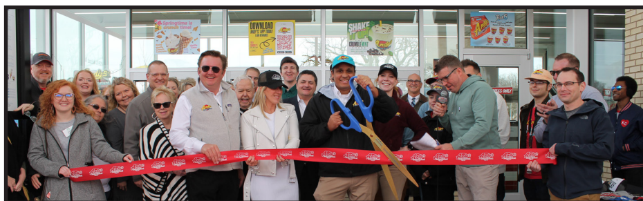
March 29, 2021 Andy's Frozen Custard 3424 NW Duncan Blue Springs MO 64015