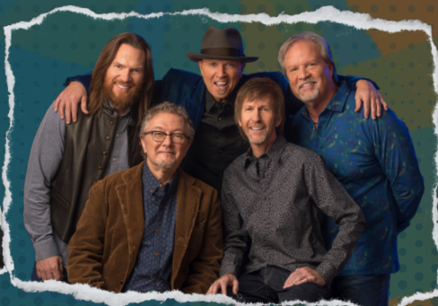
Sawyer Brown Saturday, Sept. 4th