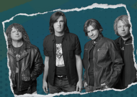
Little Texas Friday, Sept. 3rd

Sept. 3rd-6th, 2021 ★ Historic Independence Square FREE CONCERTS ★ FREE ADMISSION ARTS & CRAFTS ★ CARNIVAL