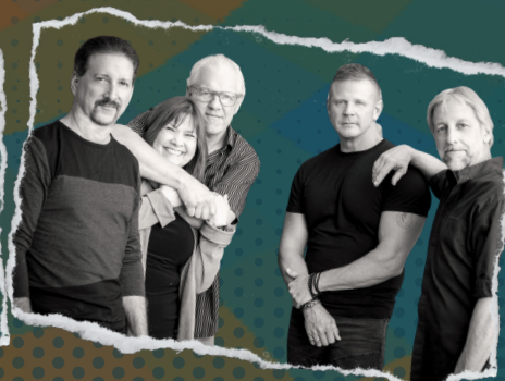
Shooting Star Sunday, Sept. 5th

FOR MORE INFORMATION VISIT SANTACALIGON.COM